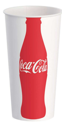
Large $1.59 290 Cal. V