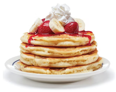
Strawberry Pancakes $5.99 950 Cal.