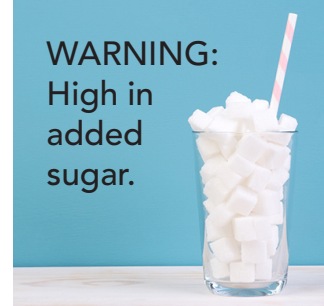
Figure 4 Examp

Examples of textonly, icon-and-text, and graphic-andtext warnings for added sugar